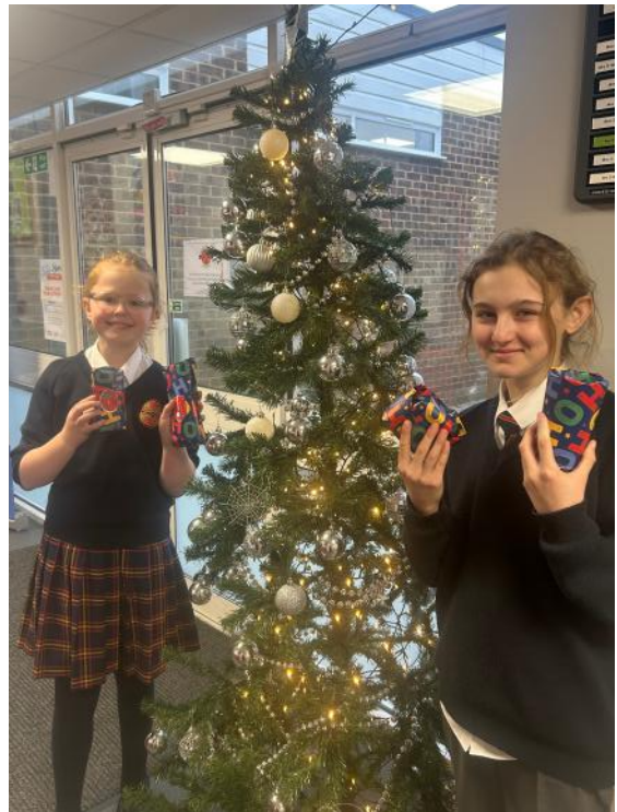
Christmas Jumper Day and Hot Lunch!