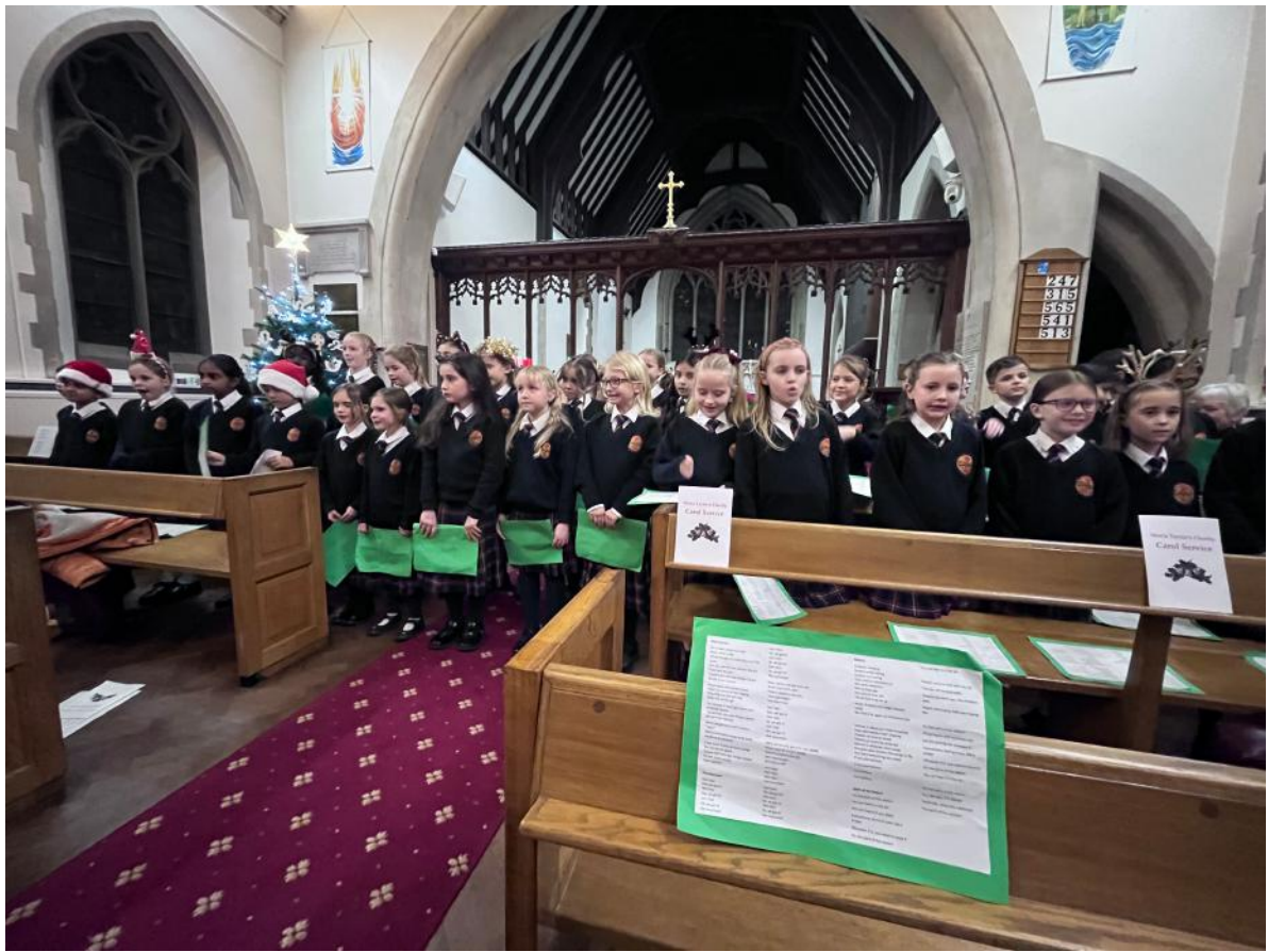
Year 6 Production 'Now That's What We Call Music'