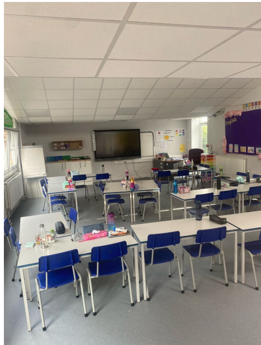
Class 9 before and after: