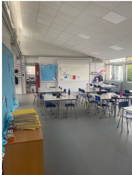
Class 8 before and after: